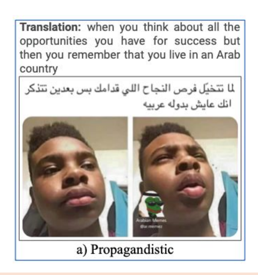
Task 2 : Given a meme (text overlayed image), detect whether the content is propagandistic.